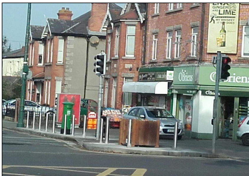
Bollards installed on St. Mobhi Road

Work is now almost complete on enhancements at the area of the junction between St. Mobhi Road and Botanic Road. Included in the works are the replacement of existing bollards with stainless steel replacements, the installation of replacement seating at the shops and across the road at the bank, the repositioning of existing bike racks and the installation of decorative 'St. Mobhi Road' signs. The bike racks are now in a more user friendly position where both sides of the rack can be safely utilised, increasing the capacity to secure bikes at the location. Both ends of St. Mobhi Road will now be marked by decorative signage, indicating to passers by that they are passing through what is a very attractive tree lined location. In addition to the above, the existing bins have been replaced with decorative alternatives, further enhancing the site.