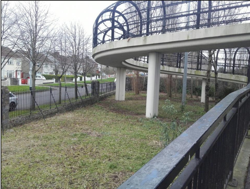
The recently cleaned site at North Road

A significant volume of illegal dumping was removed from the site under the pedestrian bridge at North Road recently. This location is constantly subject to illegal dumping and thick undergrowth, particularly directly under the bridge, most of which is now removed, made the cleaning of the site problematic. Additional fencing will be fitted on the walkway shortly to alleviate the problem of the dumping of bags into the shrubs adjacent to the wall at the rear of the site.