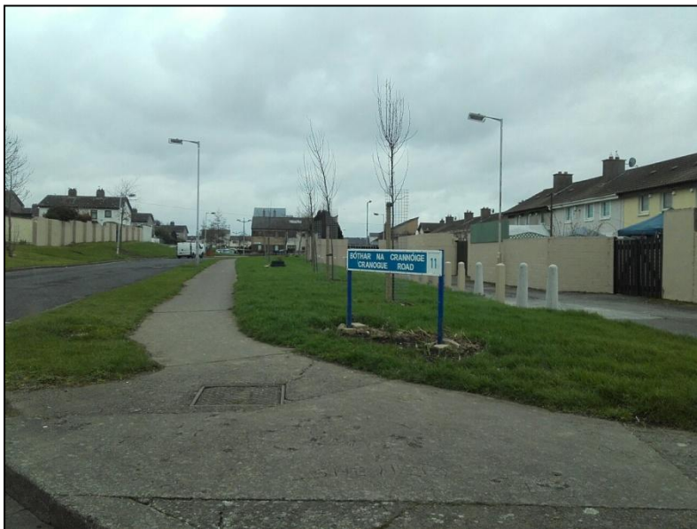
Trees on Cranogue Road

A recent contribution to this project was made by our colleagues in DCC Parks who arranged for the planting of a number of trees on Cranogue Road and at the rear of Doon Court. As these trees mature they will provide a visually attractive backdrop to a community.